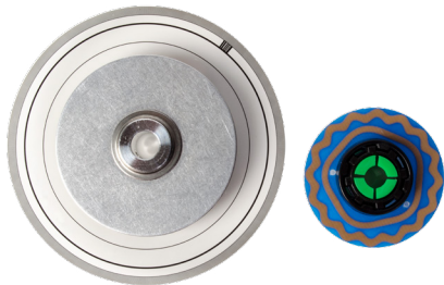
Figure 2: An optical glass disk and AMT rotor compared side by side.

The AMT encoder's ASIC-based construction is far less susceptible to vibration than the fragile glass disk of an optical encoder.