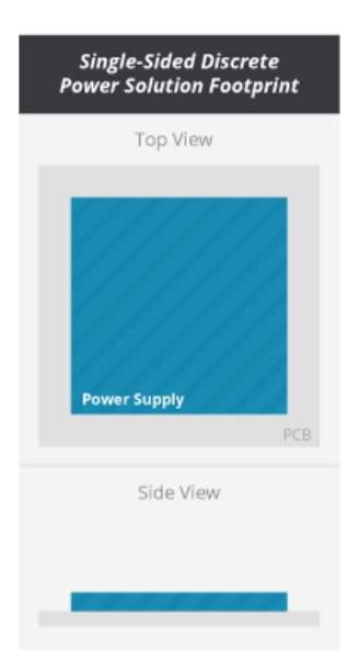
Figure 2: Example of the board space occupied by discrete and modular power solutions

Under these circumstances, where the system PCB is restricted to having components populated on just a single side, pre-designed power modules can offer substantial space savings; especially if there is the vertical space available in the application to leverage the z-axis, which is the area perpendicular to the surface of the system PCB. This greatly increases the value of a ready-made module, which is optimized for size and provides a plug-and-play solution. Figure 2 below highlights the reduction in PCB area occupied as a design transitions from a single-sided discrete power delivery solution, to a double-sided discrete power delivery solution, and finally to a pre-designed power module, which is able to capitalize on space in the z-axis above the PCB.