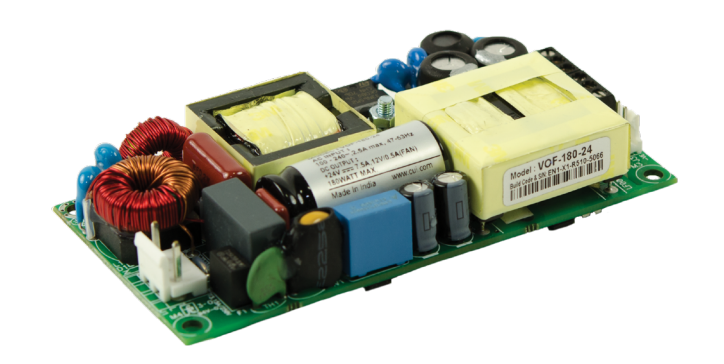
Figure 1: CUI's VOF-180 is an open frame ac-dc power supply delivering up to 30 W/in³ in a 2" x 4" chassis mount package

Off-the-shelf power modules are often optimized for size and are capable of delivering the highest number of watts in the least amount of space. As an example, Figure 1 below highlights CUI's <u>VOF-180 series</u> ac-dc power supply, which delivers a power density up to 30 W/in<sup>3</sup> in a 2" x 4" chassis mount package.