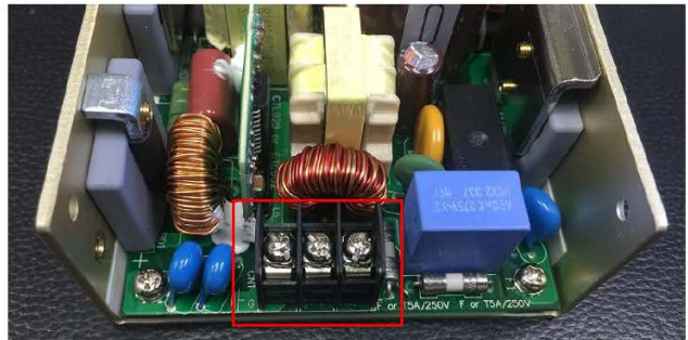
New terminal block-